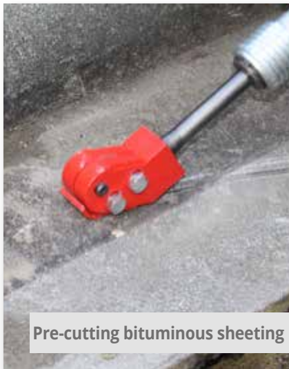
Pre-cutting bituminous sheeting