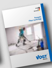
Parquet Floor coverings