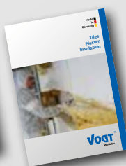
Tiles Plaster Insulation