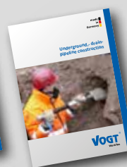
Underground, drain- pipeline construction