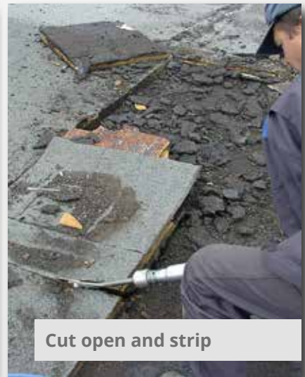
Cut open and strip