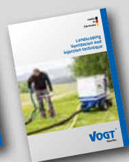
Landscaping Aeration and injection technique