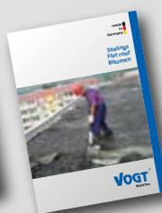
Sealings Flat roof Bitumen